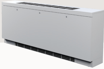
Exposed Flat Top Cabinet Model 41VX